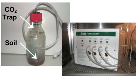
Figure 1: Sample chamber & Respirometer

Figure 1 is a photograph of a 4-channel respirometry unit and sample chamber. The soil sample is first placed into the bottom of the glass chamber and is sealed to prevent the influx of outside air. Each chamber is connected to a very sensitive pressure transducer, which allows measured quantities of oxygen to enter the chamber as the soil organisms respire. To prevent the accumulation of CO 2 within the chamber, a trap (usually filled with KOH) is inserted in the neck of the vessel. As respiration continues, the resulting oxygen utilization creates a slight vacuum within the sealed chamber. This activates a pressure transducer, which then opens a metering valve to allow a